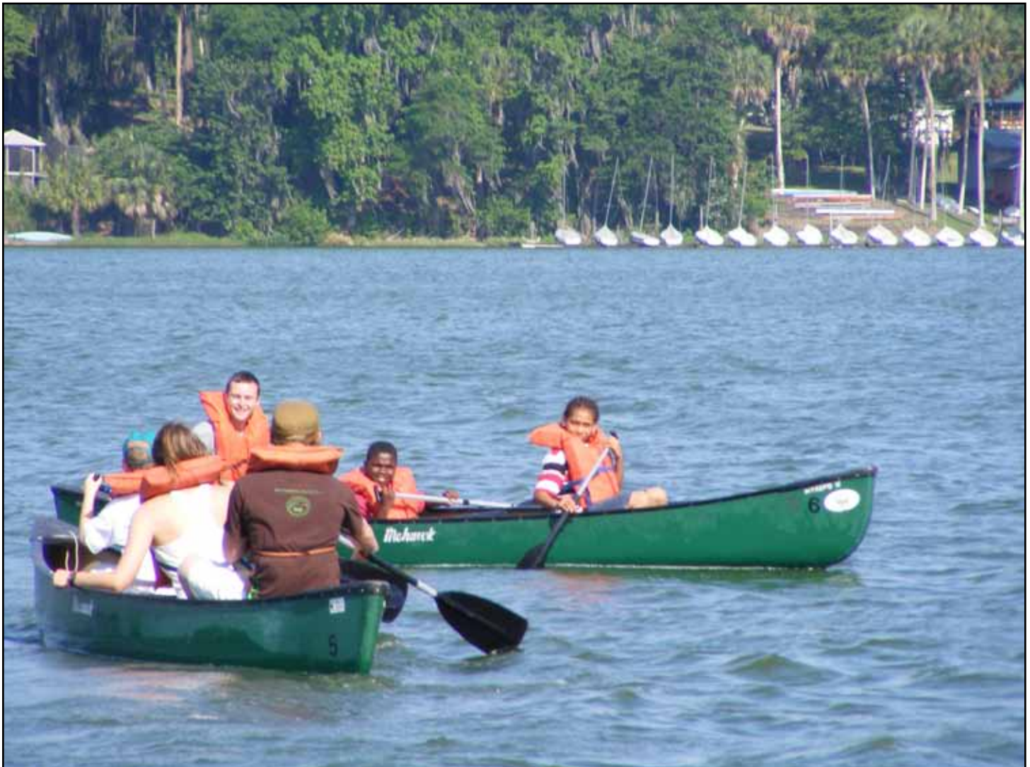
ICO participants canoeing on a trip to Lake Wauberg in Payne's Prairie Park on April 16.

A few trips are planned for the months of July and September, either to the beach or to the springs to enjoy the cool water in these long hot days of summer.