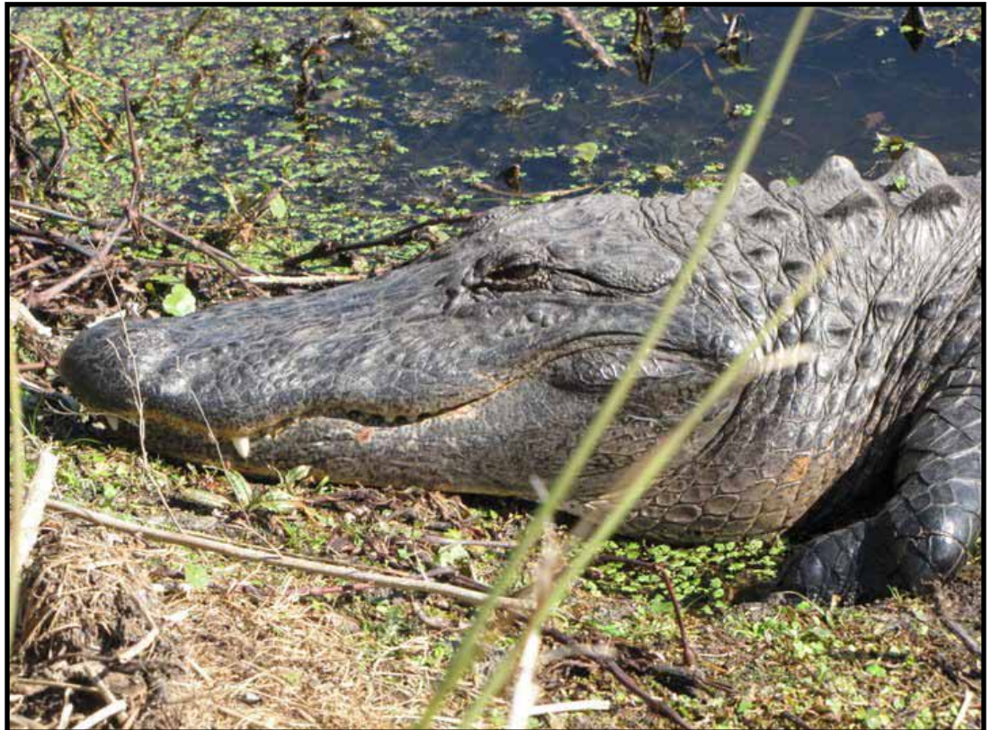
"What a friendly fellow." An alligator suns on the bank at Payne's Prairie.

Alligators are a threatened species according to the U.S. Fish and Wildlife Service. To protect them, we must protect ourselves.